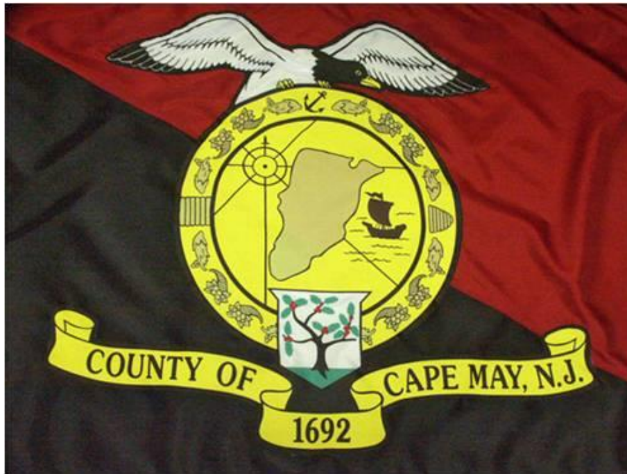
The flag of Cape May County, NJ depicting a strong maritime and farming heritage.

The first recorded court session was held in Coxe Hall in May 1692. The County Clerk's records show the earliest deeds granted land from the West New Jersey Society.